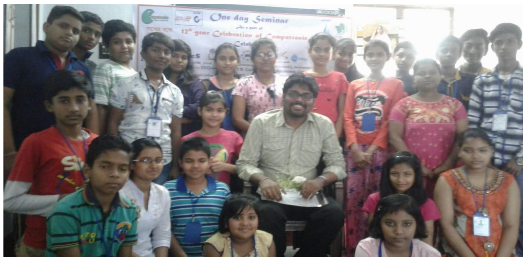
Seminar on English Literature