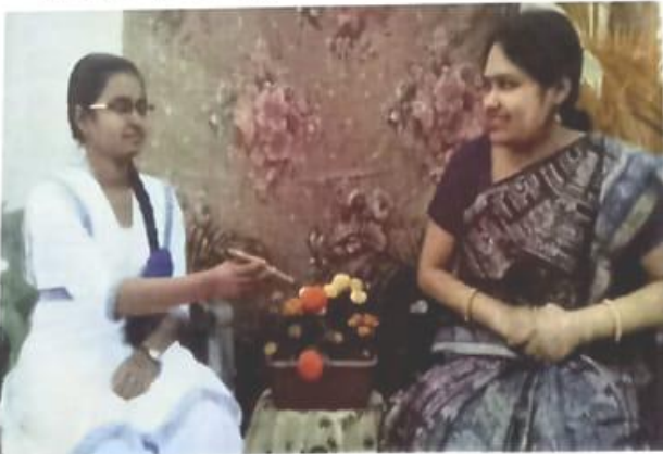
সাক্ষাৎকার গ্রহণ চলছে

কু→একাধিক রয়েছে। তবে 2010 এ আকাশবাণী তে গাওয়া। 2018-তে কুমার শানুর সাথে ডুয়েট-রেকর্ডিং করা।