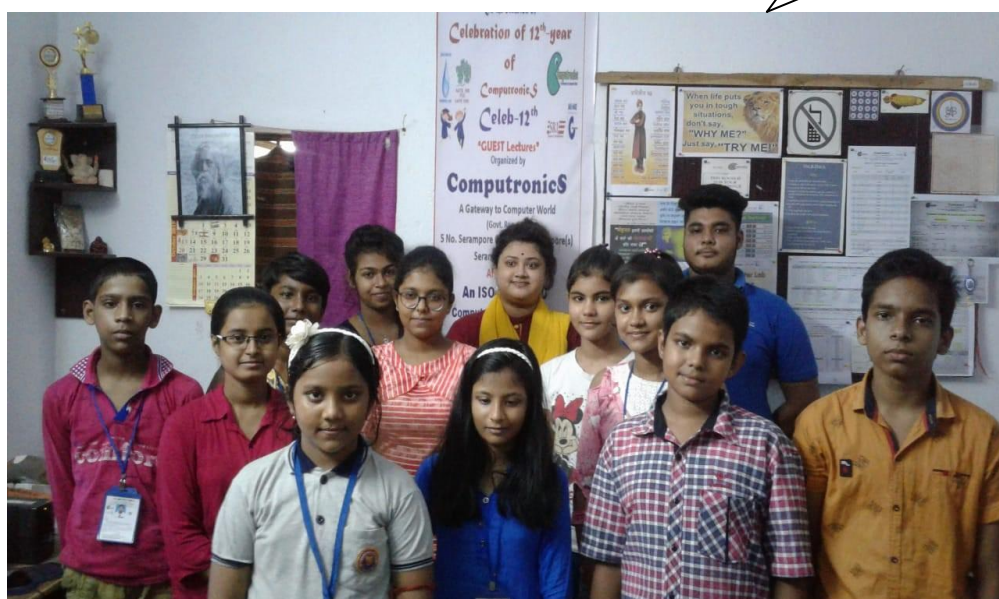
One day Seminar on Literature