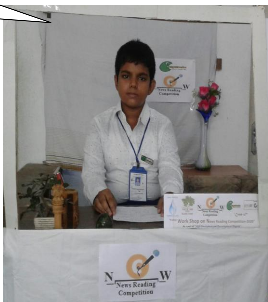
News reading competition