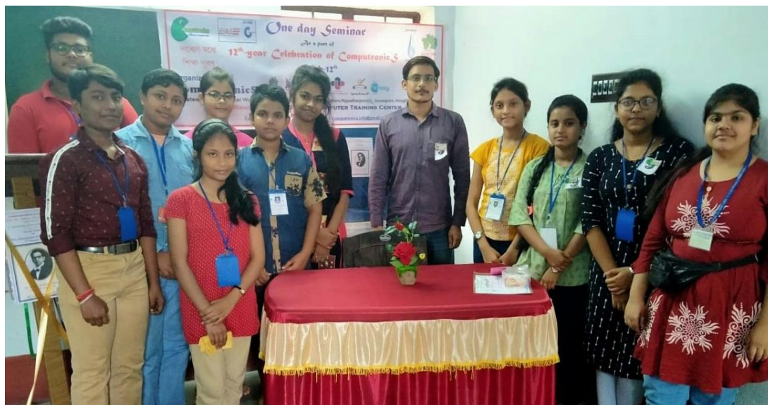
Seminar on Cloud Computing