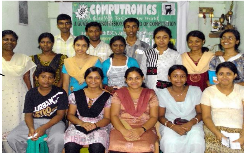
Batch of 2010-11