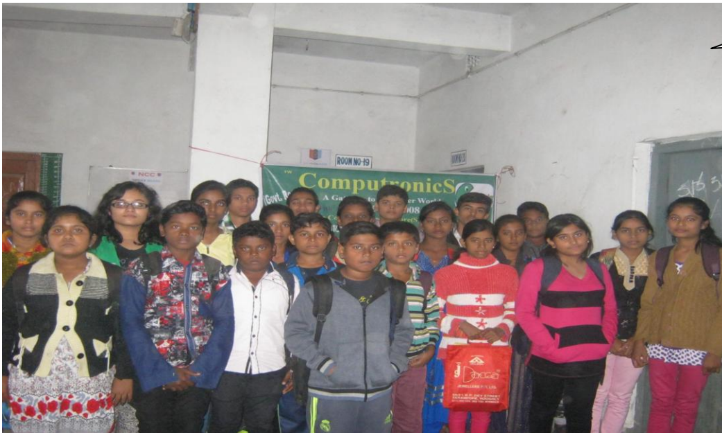
Batch (NBCE) 2015-16