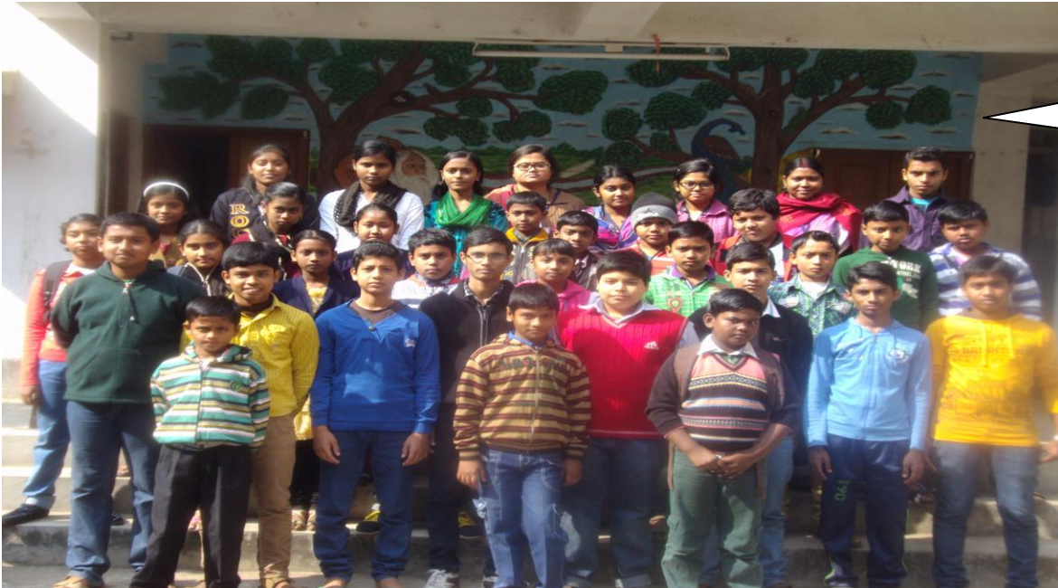
Batch of CBF 2012-13