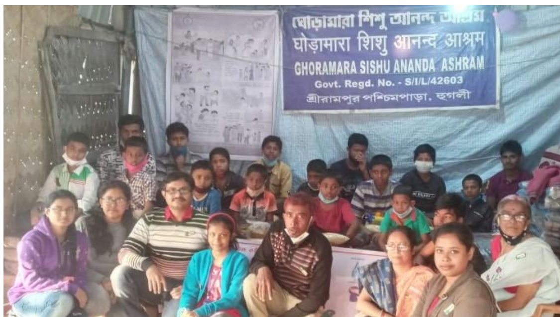
Visit for Welfare