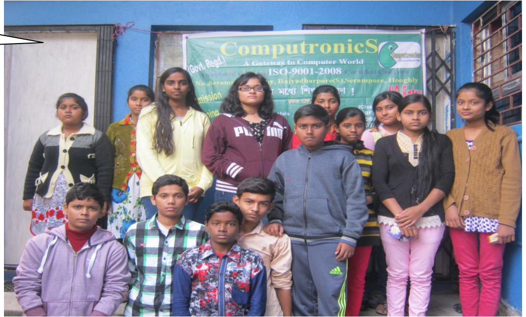
Batch (IT-KID) 2013-14